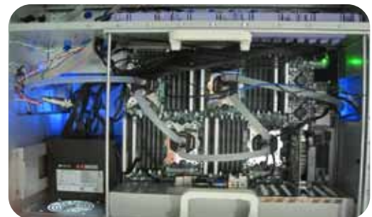
• Virtual EM's 64-core 512GB Ganymede system available to Cloud customers