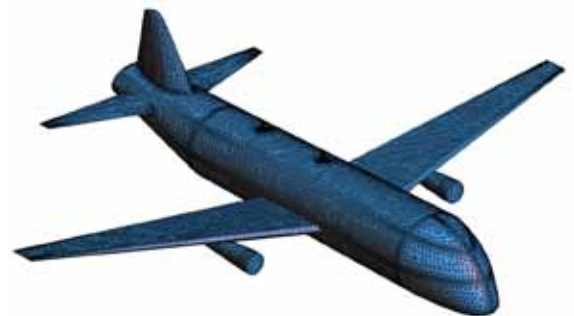
• Boeing 737 with two blade antennas readied for co-site analysis